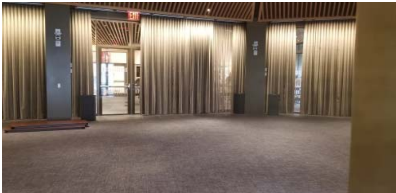
Meeting room / flexible event space has curtains that can be opened to let in more light or closed for privacy/film screenings.