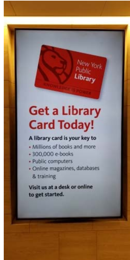
Content on electronic signs rotates through various messages.