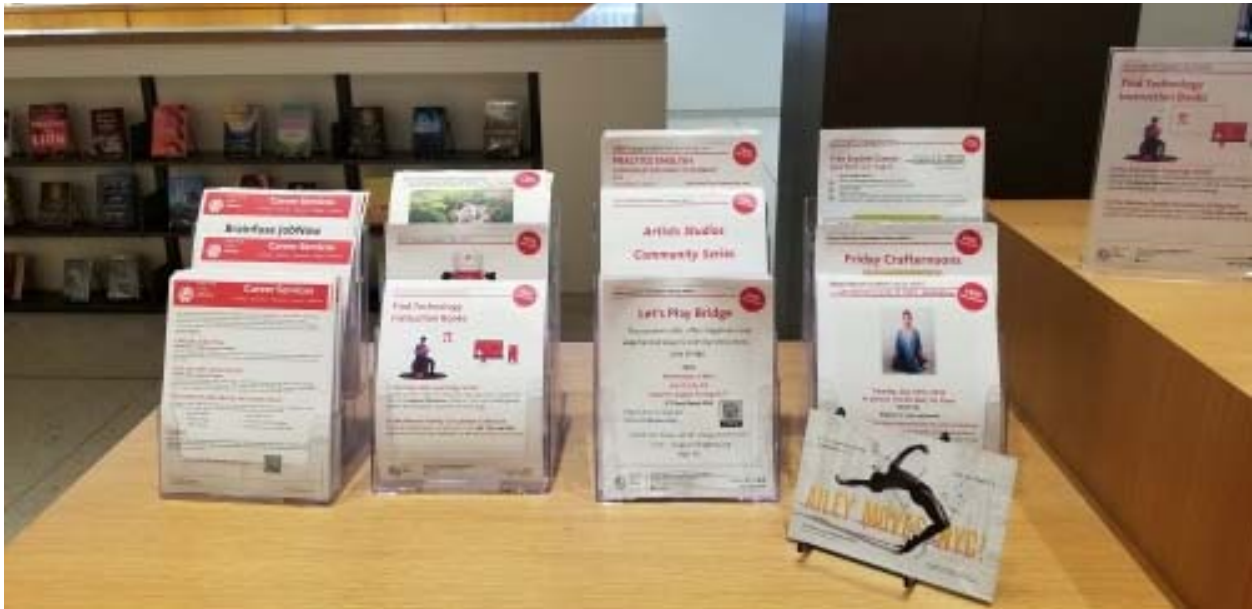
Programming is prominently featured. They work hard at marketing what they have to offer.