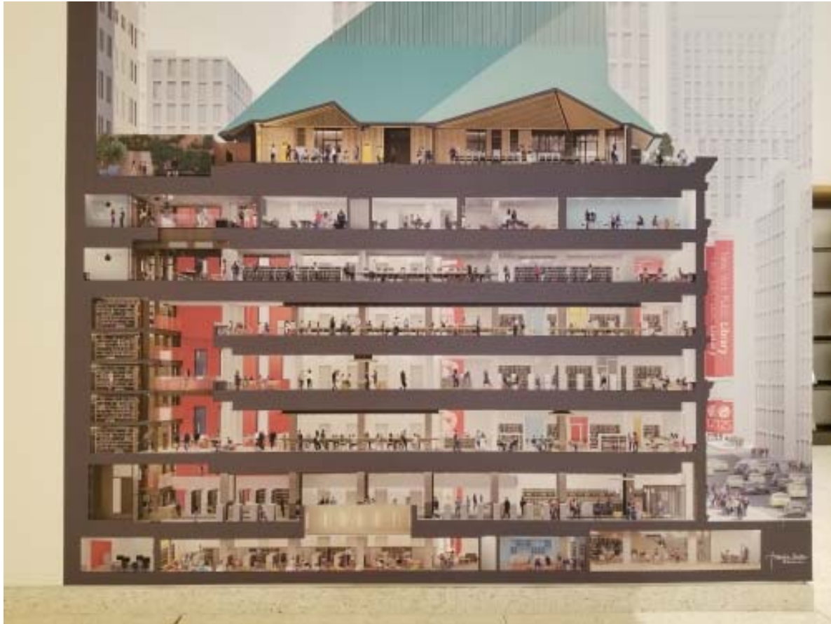
interior wall displays a cutaway diagram showing the entire 8 floors of the building.