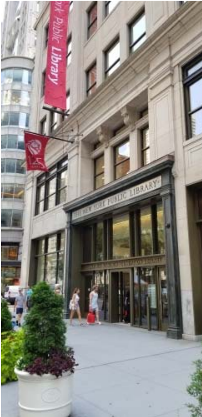
Exterior of newly renovated Stavros Niarchos Foundation Library (SNFL). It was formerly the Mid-Manhattan branch and prior to that, a department store. Adaptive re-use!