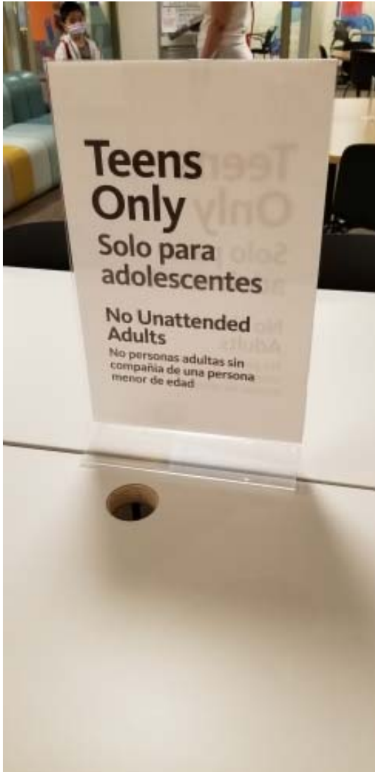
No adults in the teen area, please !