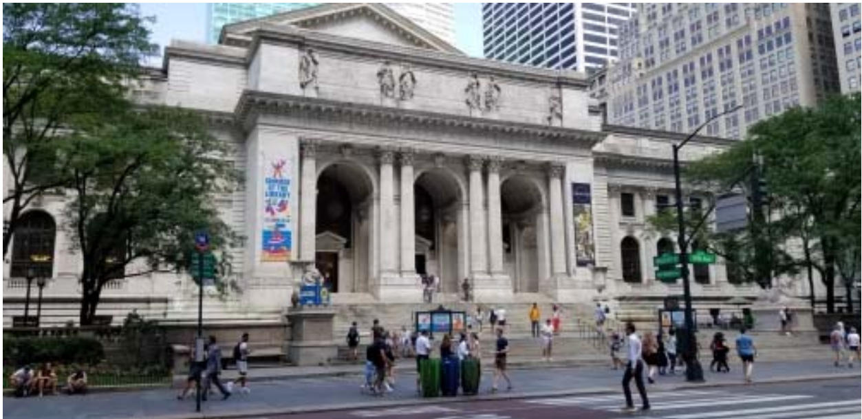
Main Branch, New York Public Library

This building is located diagonally across 5 th Avenue from the main NYPL building, slightly to the east on the southeast corner of 40 th and 5 th Ave. If the main branch is more of a museum, this is the real, working public library building.