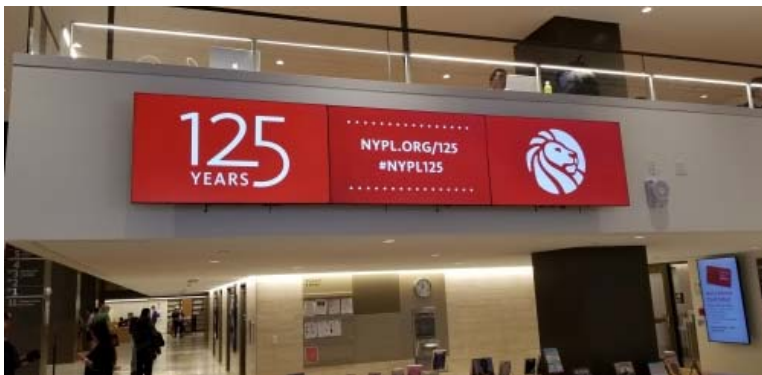
They are making the most of their 125 th anniversary.