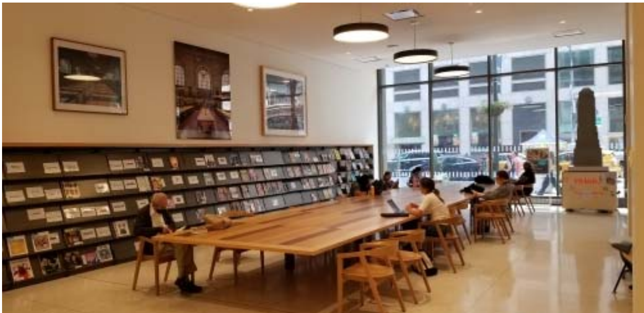
Long tables echo the feel of the main branch. Note the artwork on the walls.