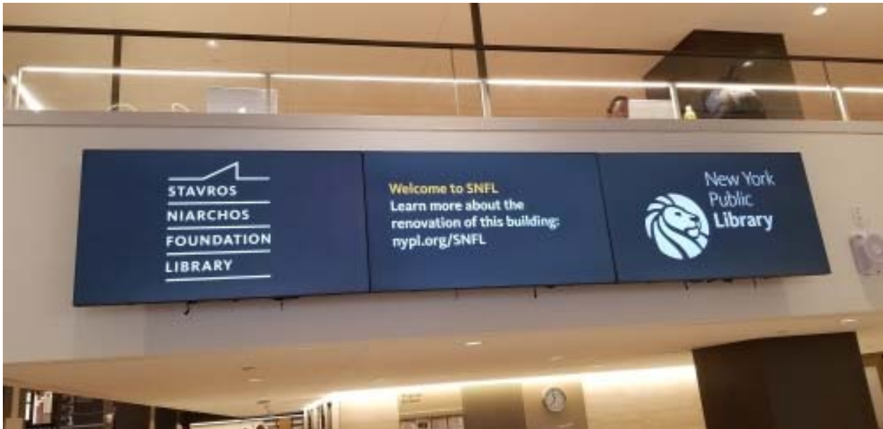
Strong and repetitive graphic design throughout the building in all of the signage, brochures, and literature.