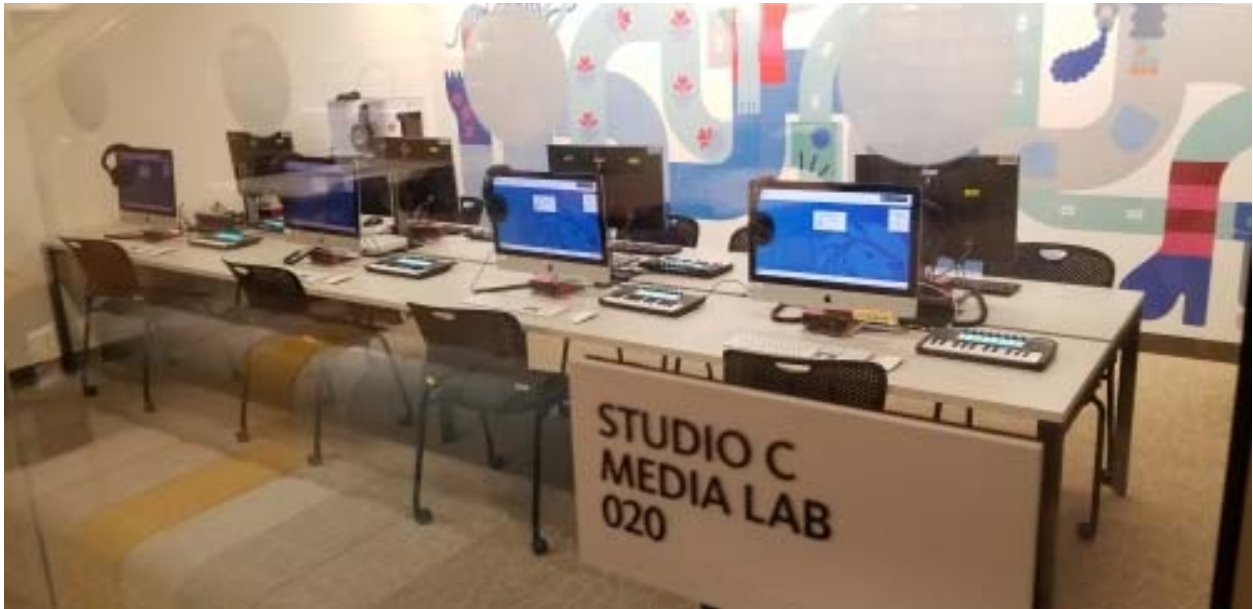
Technology is a big deal.