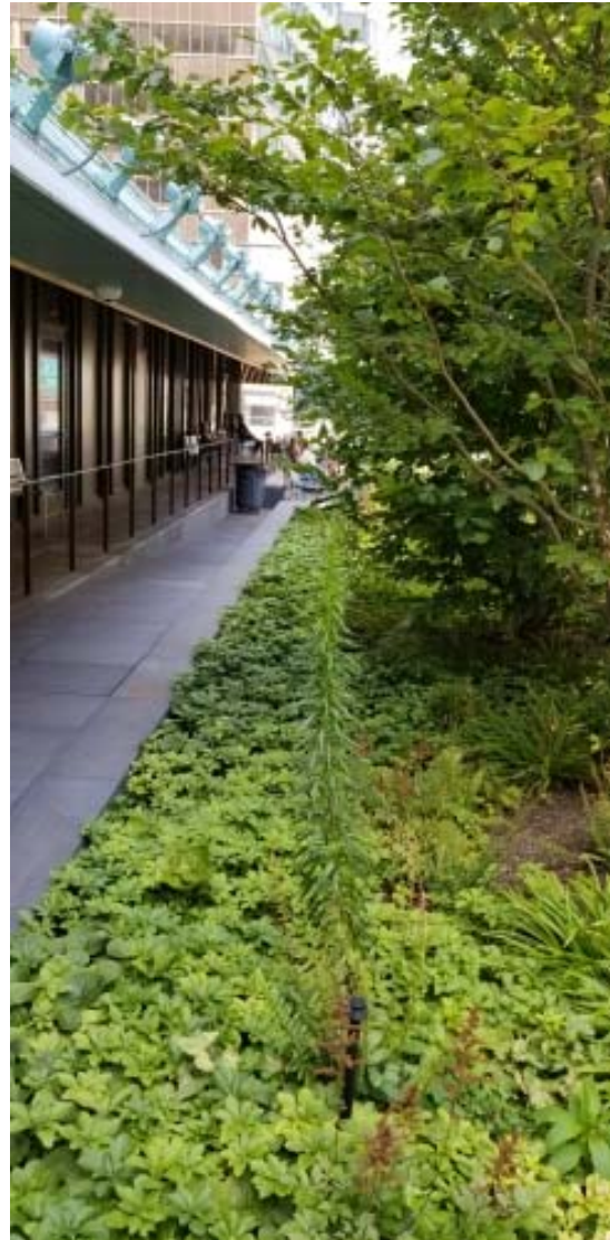
near rooftop garden space