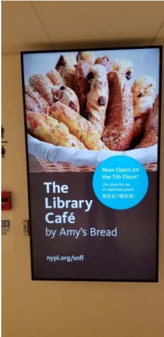
Café on top floor