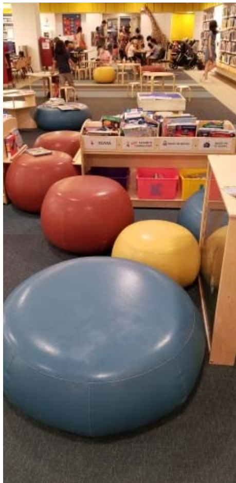
Comfy seating in the children's area.