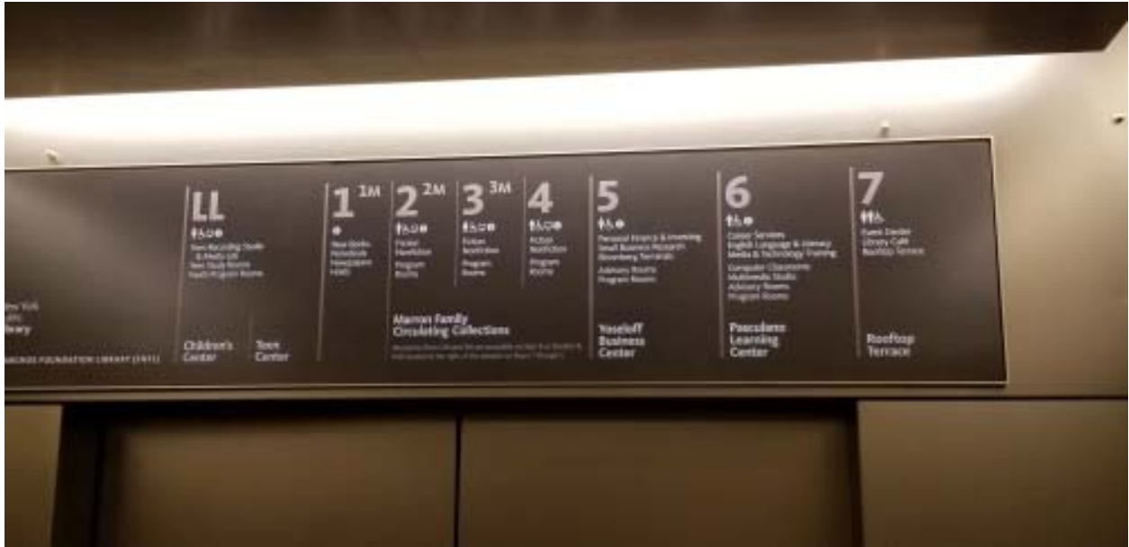
Signage is very strong throughout the building. Not only is the building named for the lead gift of $55 million; the collections, the business center, and the learning center are also named for major donors.