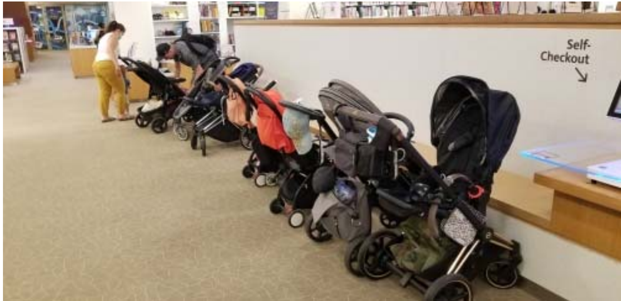
Stroller parking for story time.