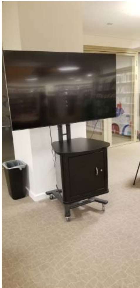
Right: locker contains video-game consoles with earphones for teen video-game play.

N.B. not pictured – an enormous collection of graphic novels for adults.