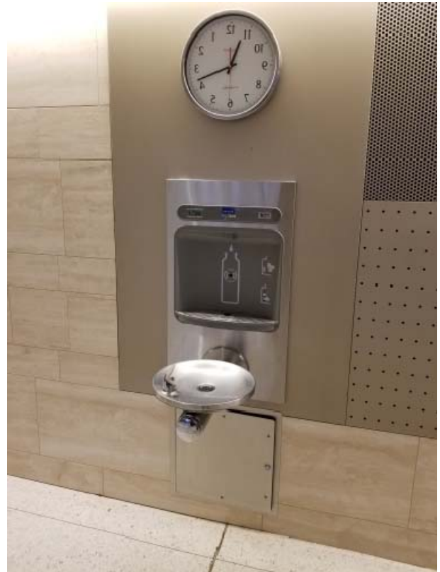
Drinking fountain with water-bottle filling.