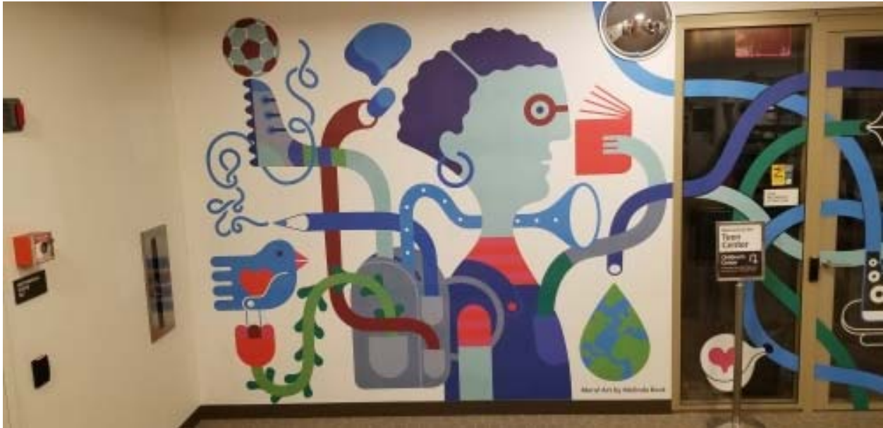
Lots of artwork enlivens the space – especially the windowless downstairs.